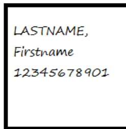
Back side of photos